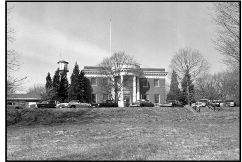
VIEW OF NORTH CAROLINA ORTHOPEDIC HOSPITAL, GASTONIA, NC