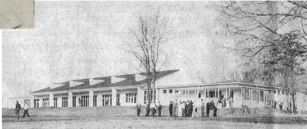
Right: Gastonia Country Club, 1920's